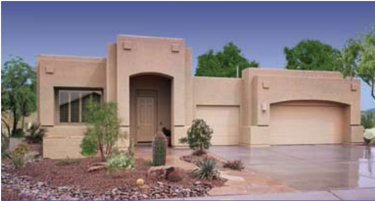
Exterior Design A