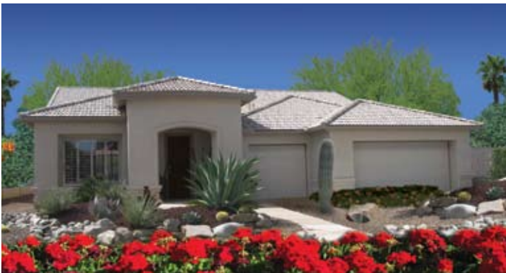
Exterior Design C