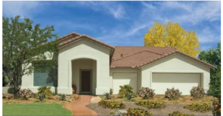
Exterior Design B