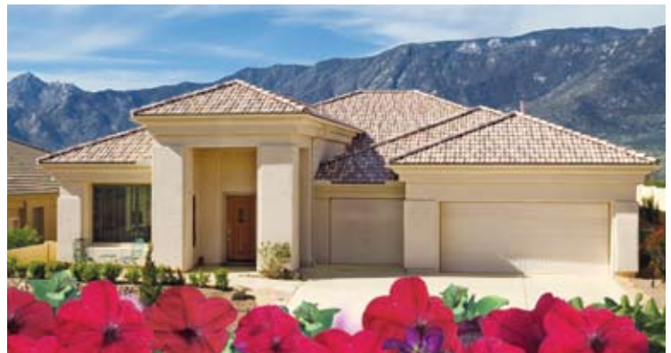
Exterior Design D

Directions to SaddleBrooke from Tucson International Airport: Drive North on Tucson Blvd. to Valencia - turn left - approximately 3 miles you'll see the on-ramp to I-19 on your right. Take I-19 to Tucson/I-10 junction. Travel West on I-10 (North towards Phoenix) 12 miles to Ina Road (Exit #248). Exit and turn right on Ina - travel East 6 miles and turn left on Oracle Road. Continue North through the town of Catalina to SaddleBrooke Blvd. and turn right. Continue East 2 miles on SaddleBrooke Blvd. then turn right on MountainView Blvd. and follow signs to the Model Homes.