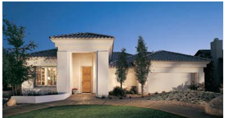
Exterior Design D

Directions to SaddleBrooke from Tucson International Airport: Drive North on Tucson Blvd. to Valencia - turn left - approximately 3 miles you'll see the on-ramp to I-19 on your right. Take I-19 to Tucson/I-10 junction. Travel West on I-10 (North towards Phoenix) 12 miles to Ina Road (Exit #248). Exit and turn right on Ina - travel East 6 miles and turn left on Oracle Road. Continue North through the town of Catalina to SaddleBrooke Blvd. and turn right. Continue East 2 miles on SaddleBrooke Blvd. then turn right on MountainView Blvd. and follow signs to the Model Homes.