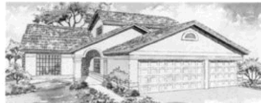
Exterior Design A