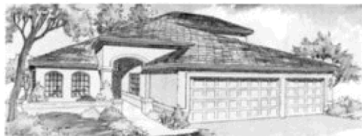
Exterior Design C

Ceiling heights will vary per room, per exterior design. Check with your New Home Consultant.