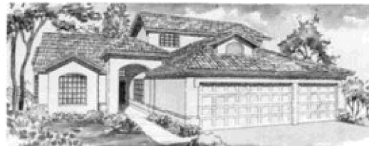
Exterior Design B