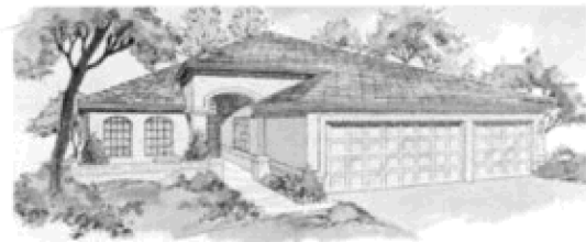
Exterior Design C