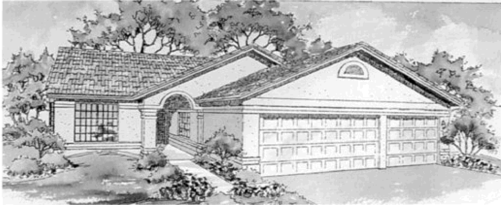
Exterior Design A

2,838 Livable Square Feet. 1 Story, 2 Bedrooms, Den (Optional 3rd Bedroom), 2-1/2 Baths.