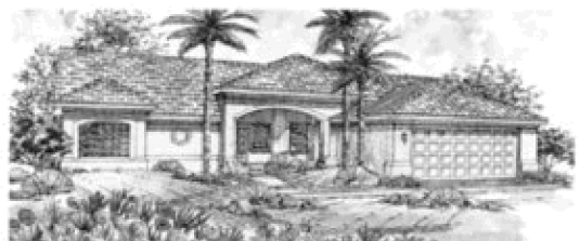
Exterior Design E