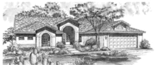
Exterior Design D