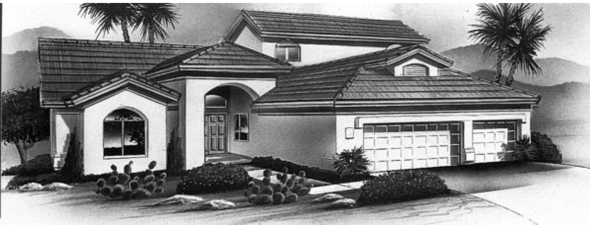
2 Story, 3 Bedrooms, Den (Opt. 4th Bedroom), 2-1/2 Baths, 3176 Livable Sq. Ft. - Exterior Design-B