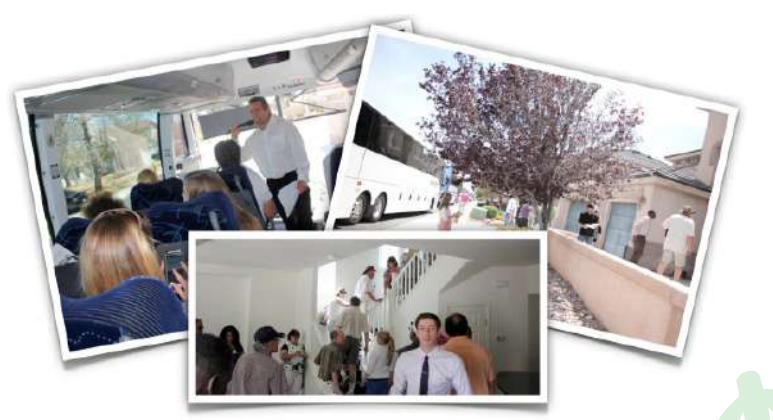
INVESTOR BUS TOUR

EXCLUSIVE HIGH IMPACT MARKETING AND NETWORKING. BOOTS ON THE GROUND!