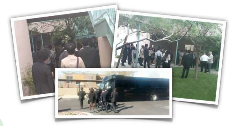
CHINA CASH BUYERS