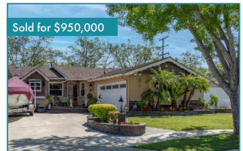
2082 Albury Avenue Single-family home in Los Altos.