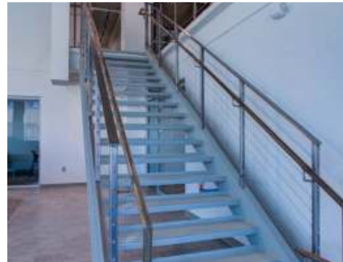
Furniture and certain fixtures and equipment shown in the photos are property of the tenant and are not included with the lease.