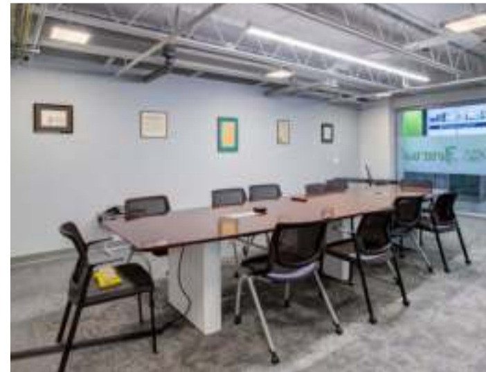
Furniture and certain fixtures and equipment shown in the photos are property of the tenant and are not included with the lease.