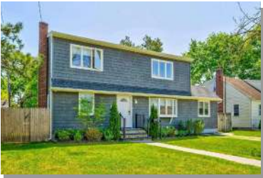
34 FREY ROAD FARMINGDALE, NY 11735