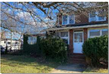
29 ROCKAWAY PARKWAY VALLEY STREAM, NY 11580

Interested to Know the New Value of Your Home?