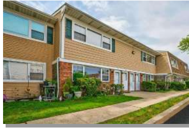
1-3 ATLANTIC AVENUE UNIT 3, FARMINGDALE, NY 11735