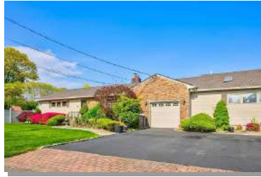
161 N. 20TH STREET WHEATLEY HEIGHTS, NY 11798