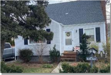
19 GARDEN AVENUE CARLE PLACE, NY 11514