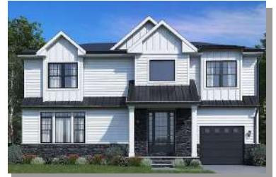
81 GRAND BOULEVARD MASSAPEQUA PARK, NY 11762