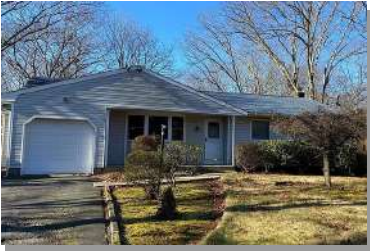
212 HELME AVENUE MILLER PLACE, NY 11764