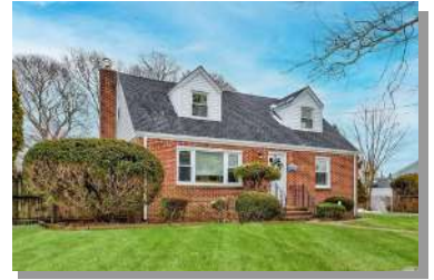
97 NELSON STREET FARMINGDALE, NY 11735