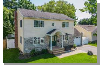
7 S WOODBINE DRIVE HICKSVILLE, NY 11801