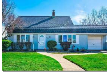
23 SWAN LANE LEVITTOWN, NY 11756