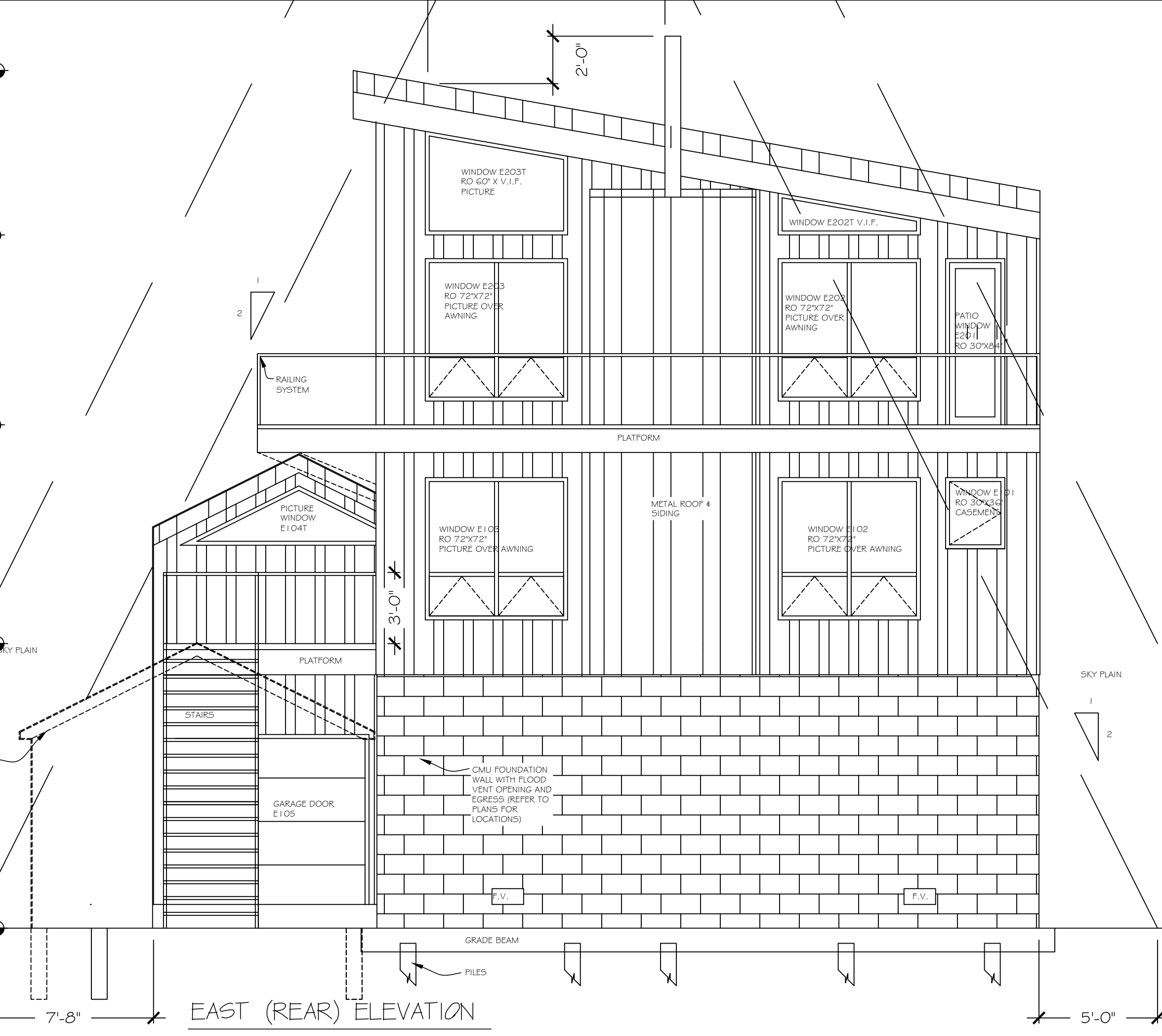
EAST (REAR) ELEVATION SCALE: 1/4" = 1'-0"

ROOF ELEV. 36'-2" TOP OF PLATE ELEV. SECOND FLOOR ELEV. FIRST FLOOR ELEV. 12'-0" SKY PLAN GRADE ELEV. 0'-0"