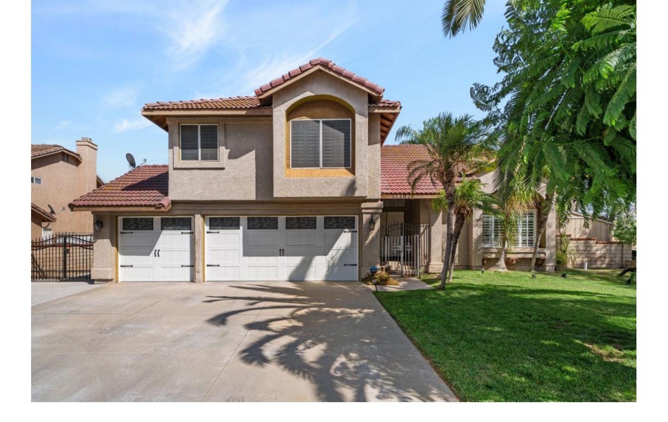
17102 Whispering Brook, Riverside