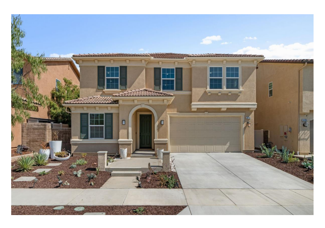
24718 Branch, Corona