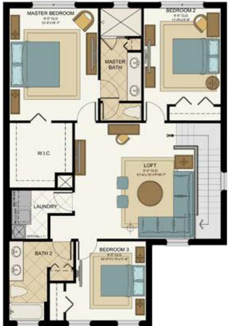
2ND FLOOR PLAN • LOFT OPTION