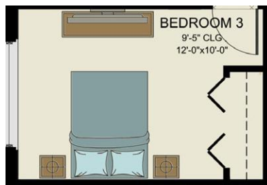
OPTIONAL BEDROOM 3 (in place of Den)