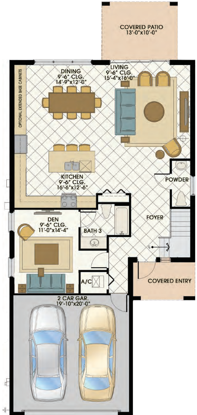
1ST FLOOR PLAN • DEN OPTION