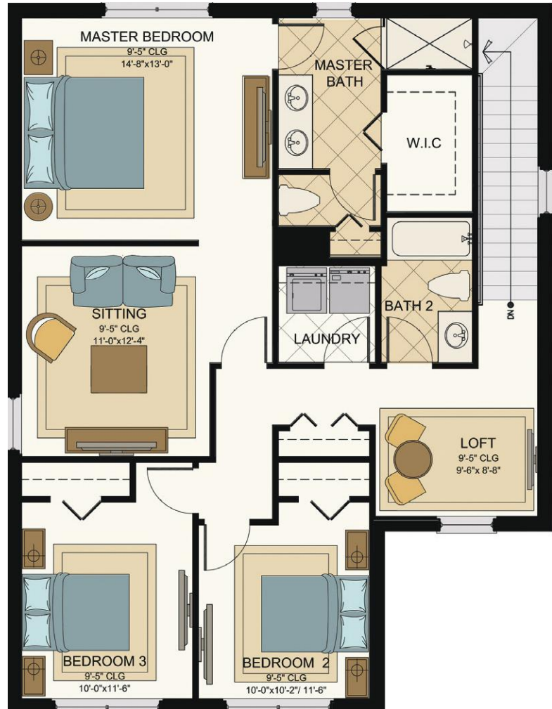
2ND FLOOR PLAN MASTER SITTING ROOM OPTION