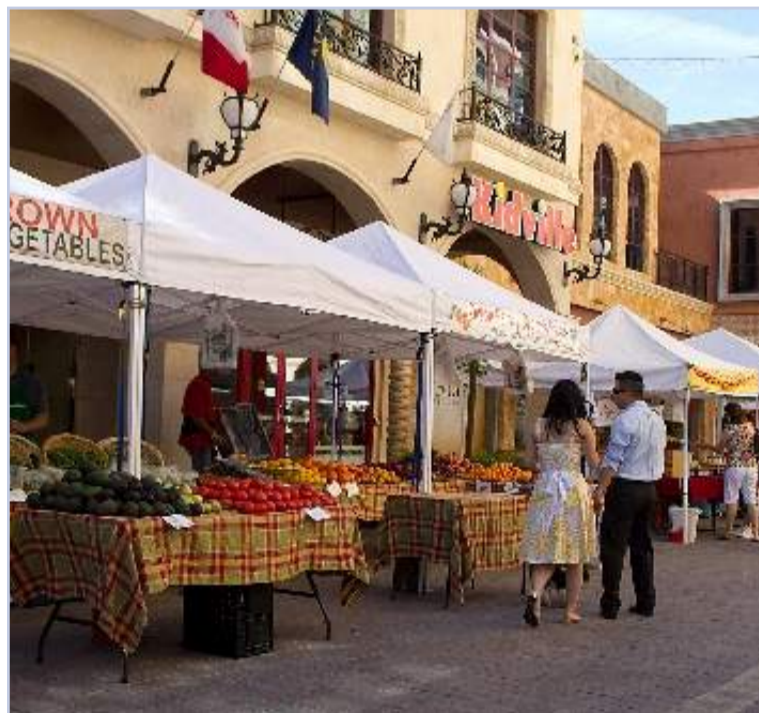
FRESH52 AT TIVOLI VILLAGE (SUNDAYS)