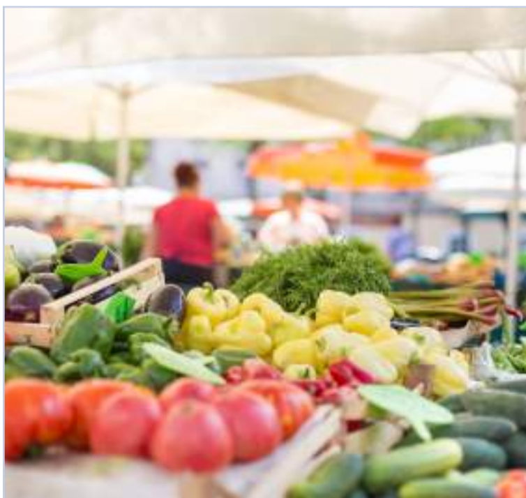
FLOYD LAMB PARK (SATURDAYS)