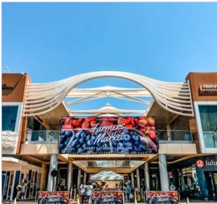
DOWNTOWN SUMMERLIN (SATURDAYS)