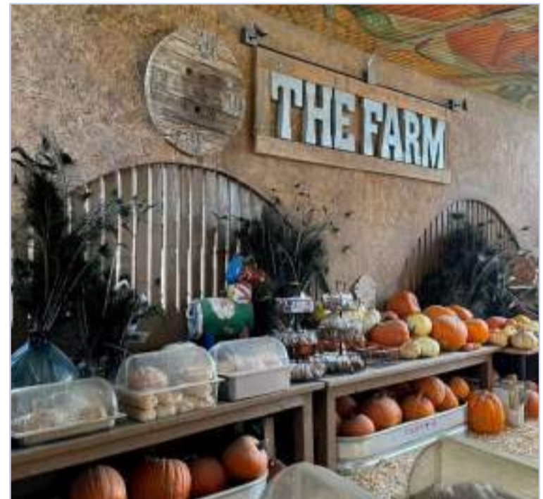
THE LAS VEGAS FARM (WEEKENDS)