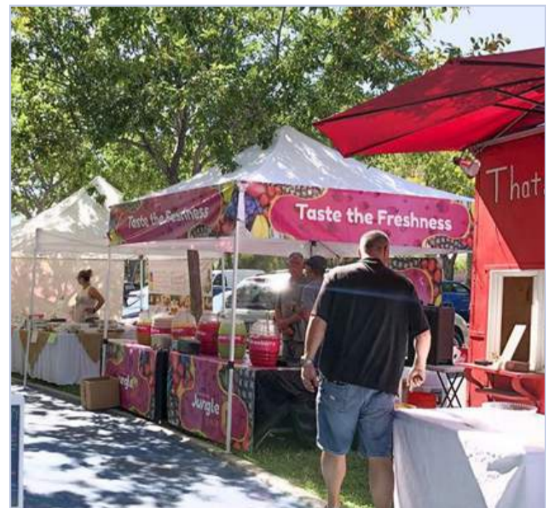
BRUCE TRENT PARK (WEDNESDAYS)