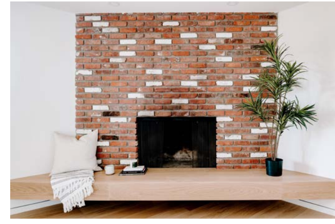
1631 Gillaspie Drive