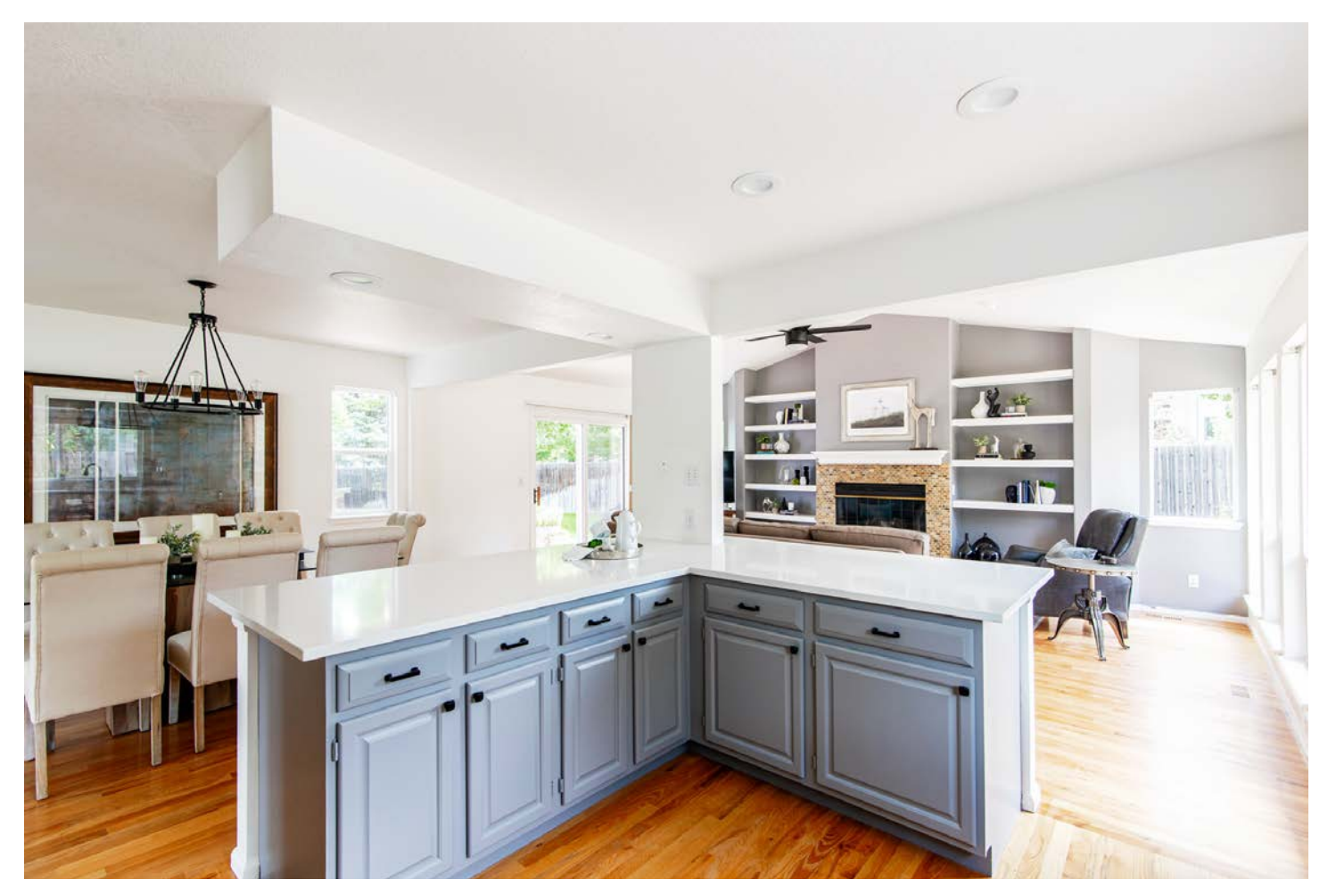
Turnkey | Modern Finishes | Mountain Views | Exceptional Location

Located on a quiet cul-de-sac in the desirable Country Club Estates neighborhood and a short walk to Boulder Country Club, Gunbarrel Open Space and LOBO trail, the heart of this meticulously updated 4 bedroom home is the kitchen featuring a large island, gleaming quartz counters, striking backsplash and hardwood floors.