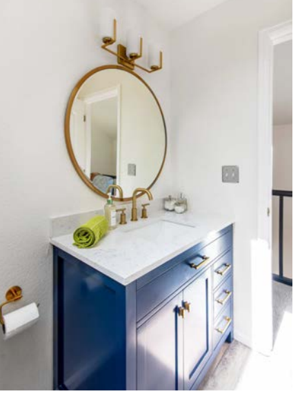
4 BD | 3.5 BA | 3,419SF