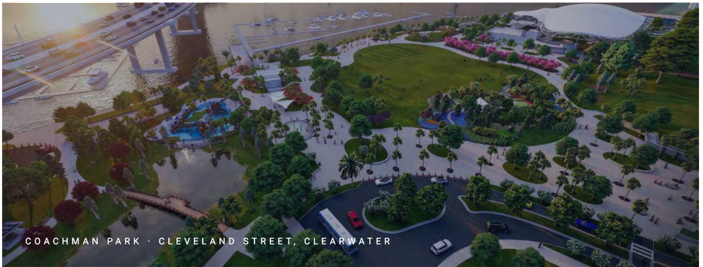
COACHMAN PARK · CLEVELAND STREET, CLEARWATER

Reborn around a forty-acre waterfront park.